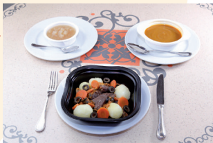
Sample “allergen-free” meal