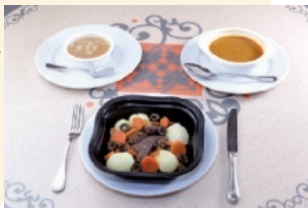
Sample “allergen-free” meal