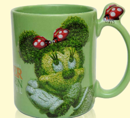
Epcot International Flower & Garden Specialty Mug

The Epcot® International Flower & Garden Festival is in full bloom! Throughout World Showcase, you'll find festival artists, experts and specialty shops that will help you bring the enchantment of the Epcot International Flower & Garden Festival home with you! Discover an enchanting array of spring-inspired apparel and headwear, garden tools and accessories, artwork and magical Disney keepsakes to adorn your home and garden!