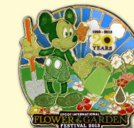
Limited Release Epcot International Flower & Garden Trading Pin

Merchandise subject to availability. For more Disney Theme Park Merchandise, visit www.DisneyParks.com/Store .