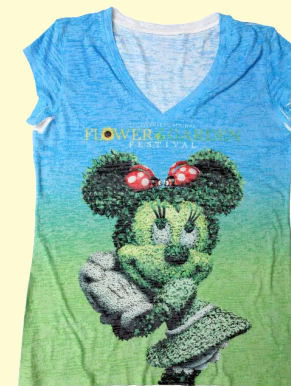
Epcot International Flower & Garden Festival Ladies Tee

SHOW US WHAT HOME (AND GARDENS) MEAN TO YOU!