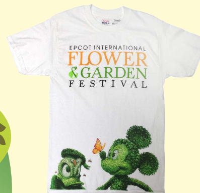
Epcot International Flower & Garden Festival Mens Tee